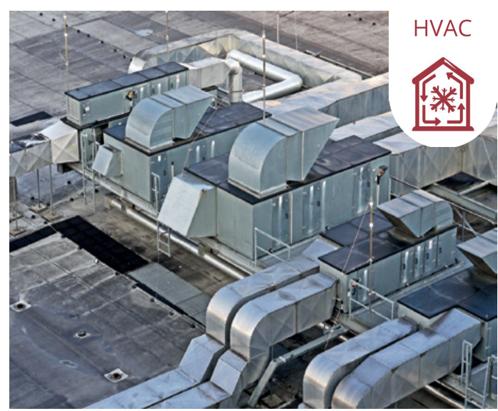
Pumps • Fans • Chillers